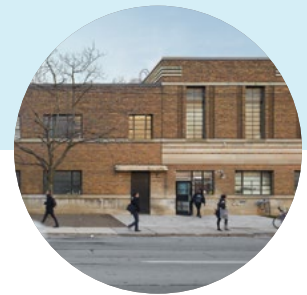
Eva's Phoenix (Downtown Toronto)

Emergency shelter for youth facing complex barriers, with specialized harm-reduction and health support services.