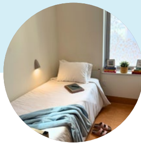
Eva's Satellite (Yonge & Sheppard)

Opened in 1994 as North York's first emergency shelter designed for youth in crisis.