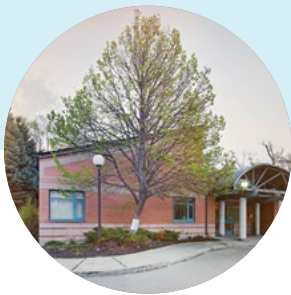
Eva's Place (Lesmill & 401)

Eva's is the second-largest shelter provider for youth in Toronto. Together, Eva's three sites provide safety and opportunity for hundreds of youth each year—from their first night of safety to the first steps to a brighter future.