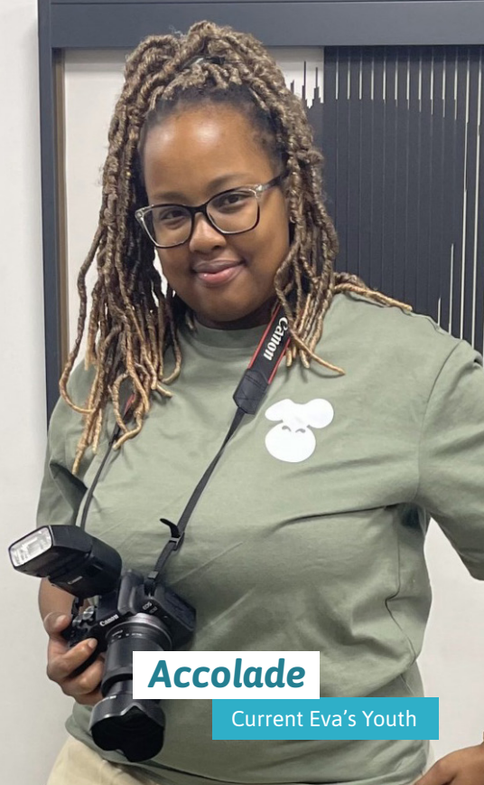
Accolade Current Eva's Youth