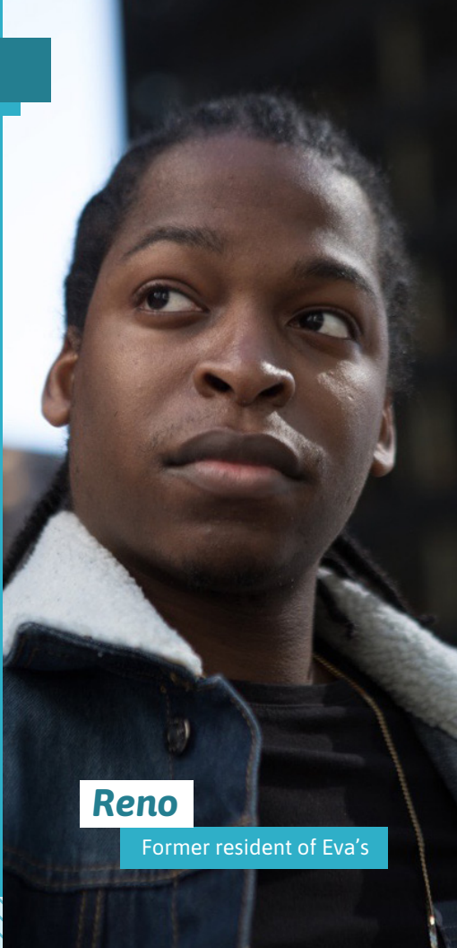
Reno Former resident of Eva's

Your generosity turns shelter at Phoenix into a launchpad for skills, confidence, and independent living.