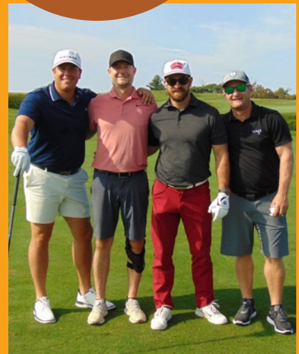
2024 WINNING FOURSOME