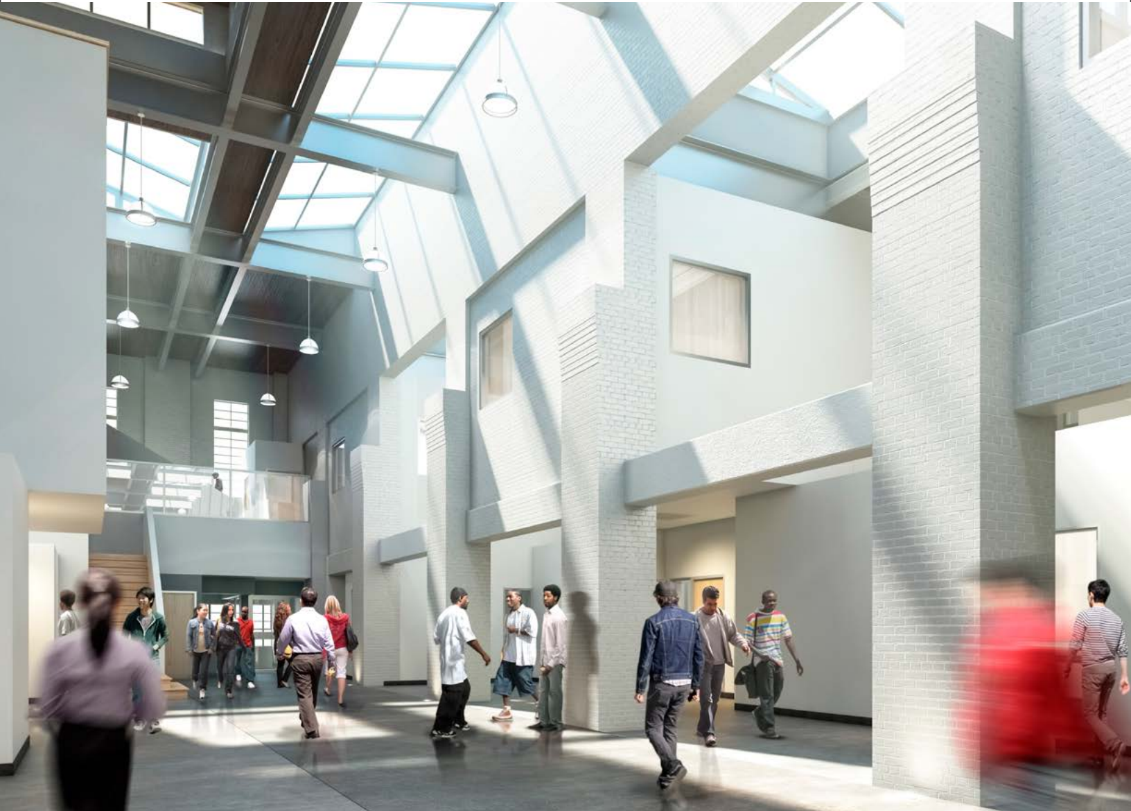
New Eva's Phoenix Main Street