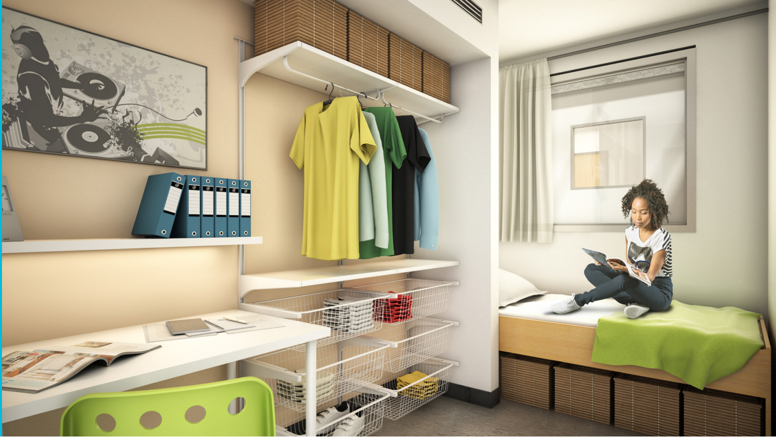
Bedroom in the new Eva's Phoenix