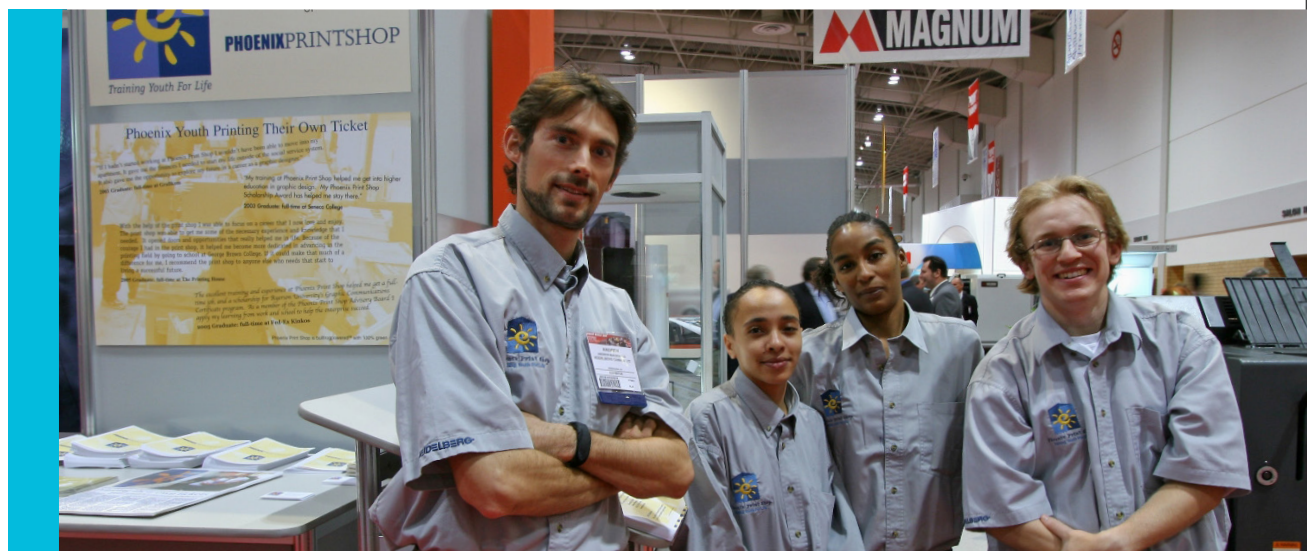
Youth receive training at Phoenix Print Shop

Since its inception, Eva's Phoenix has won numerous awards and accolades. (See Appendix B, page 20)