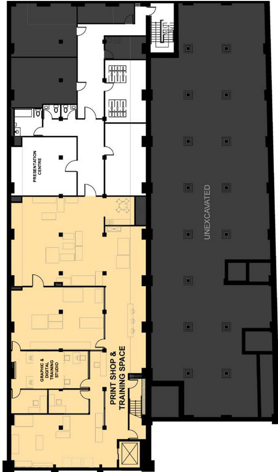
Basement level floor plan