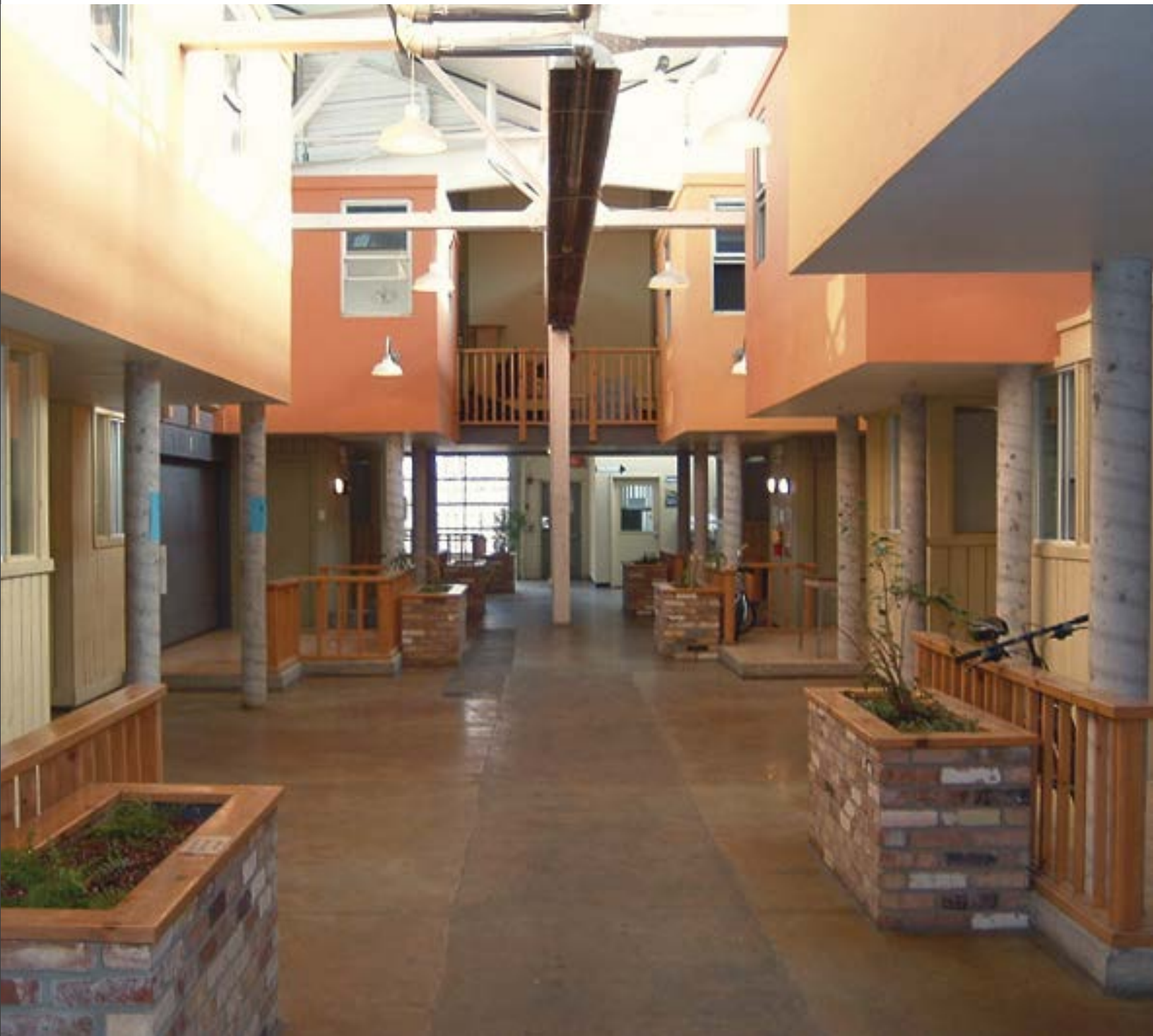
Old Eva's Phoenix Main Street