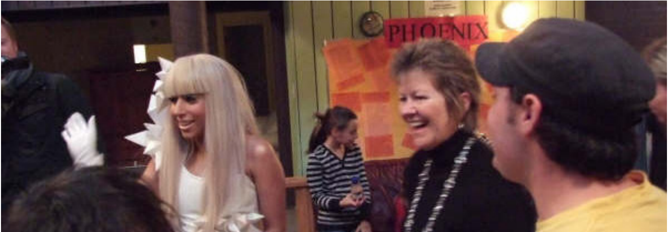
Lady Gaga visits Eva's Phoenix