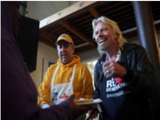
Sir Richard Branson serving a pancake breakfast to youth at Eva's Phoenix