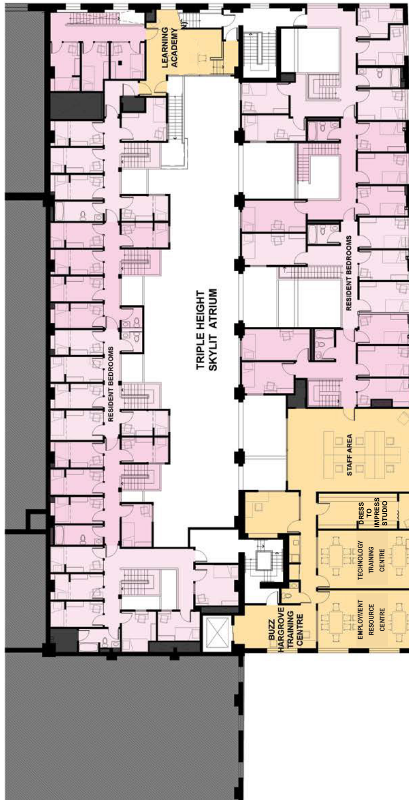
Second level floor plan