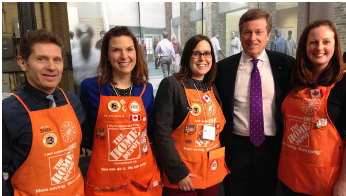
Home Depot Canada Foundation w/ Mayor John Tory at the campaign launch (March 2015)

Eva's Phoenix houses 50 youth for up to one year in townhouse-style units. What sets Phoenix apart are its innovative partnership-based employment programs to train and find employment for homeless youth in jobs offering long-term career potential. The programs, supported by a variety of mentorship initiatives, help our youth succeed in developing self-sufficiency in housing and employment.